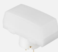
【Pearl white lens】